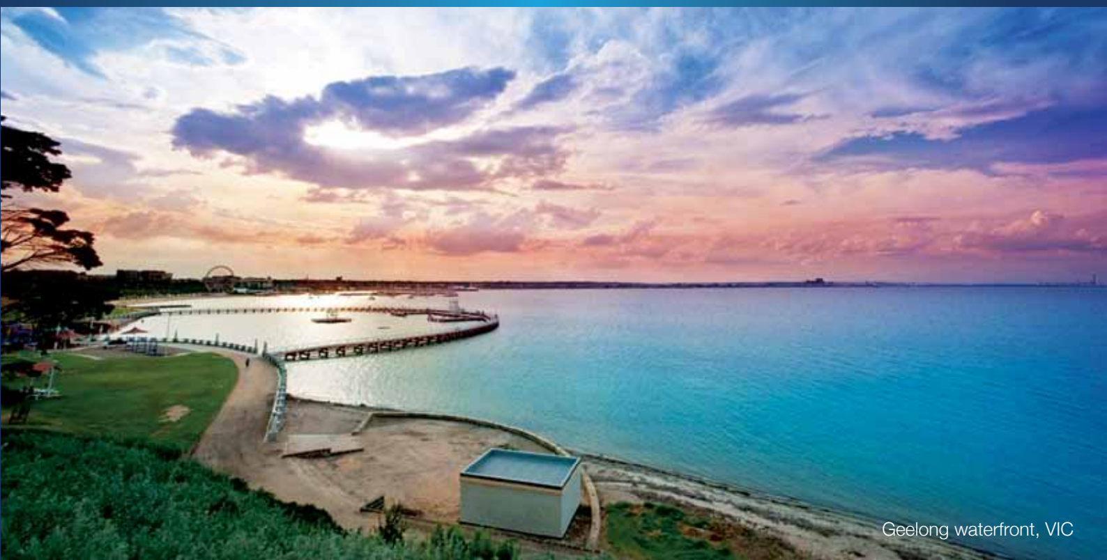
Geelong waterfront, VIC

Annual Scientific Meeting 2013 Tues 27th - Sat 31st August At Four Points Hotel Geelong, on the waterfront