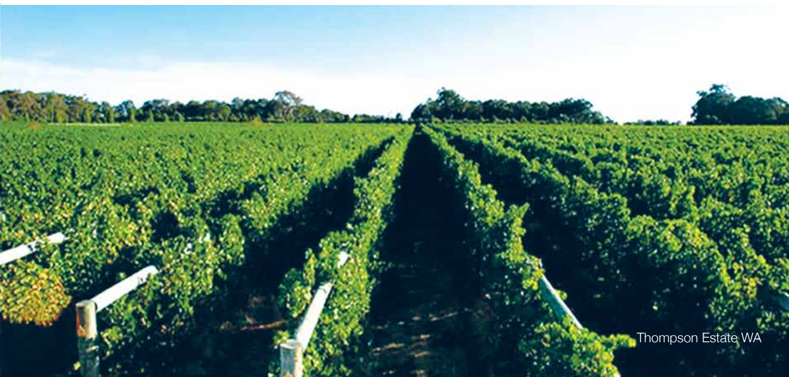
Thompson Estate WA