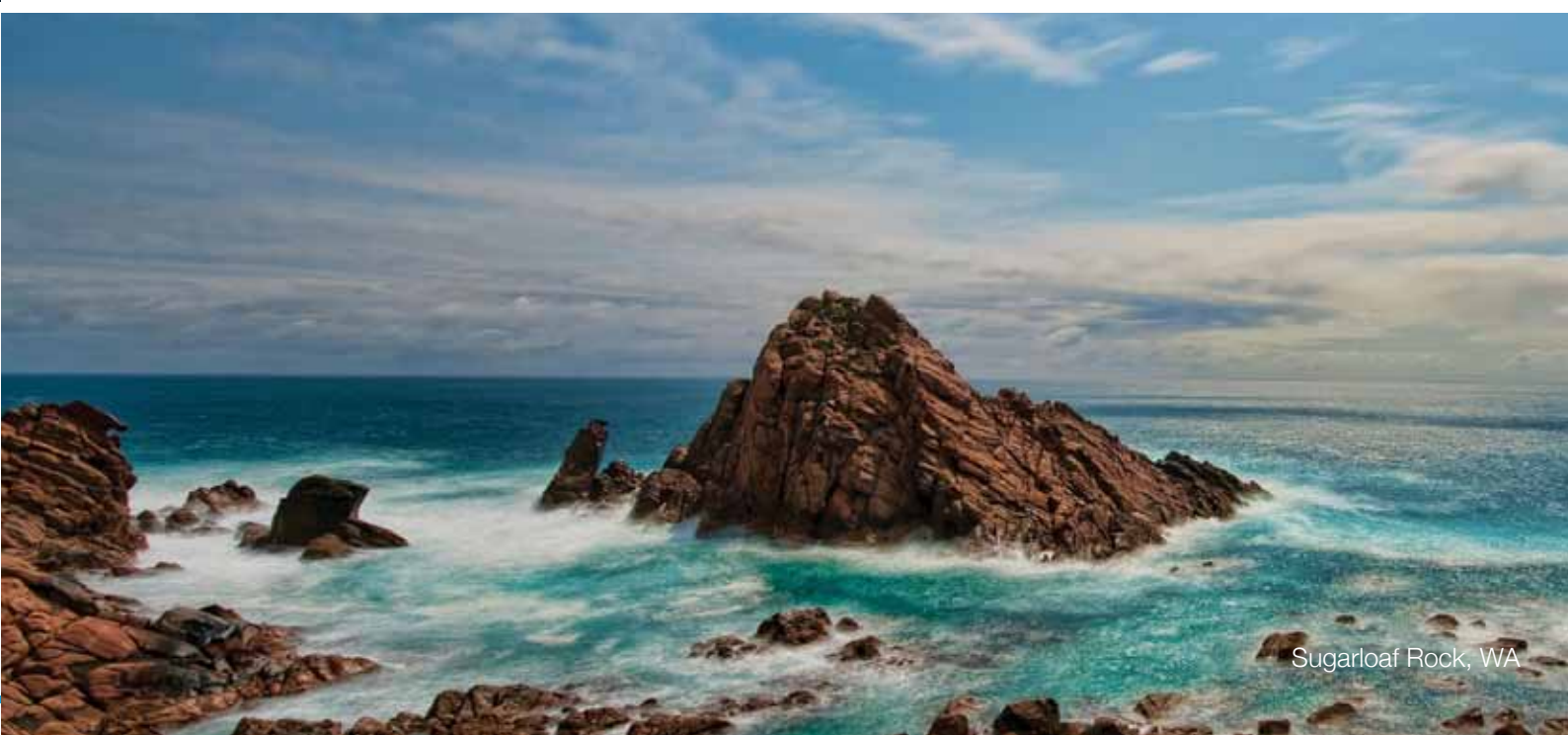
Sugarloaf Rock, WA